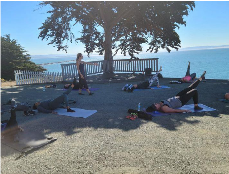
Pilates at Point San Luis in September 2021.